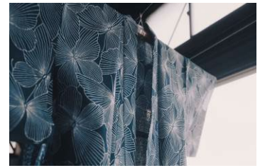
Marukyu (chusen-dyed items)

Designers from the Bureau du Design, de la Mode et des Métiers d'Art (BDMMA)