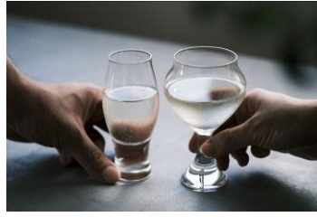
Kimoto Glass Tokyo (Edo-style kiriko cut glass and glassware)