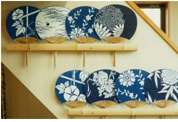
Ibasen (Edo-style uchiwa and sensu fans)

Model companies participating in the collaborative design project.