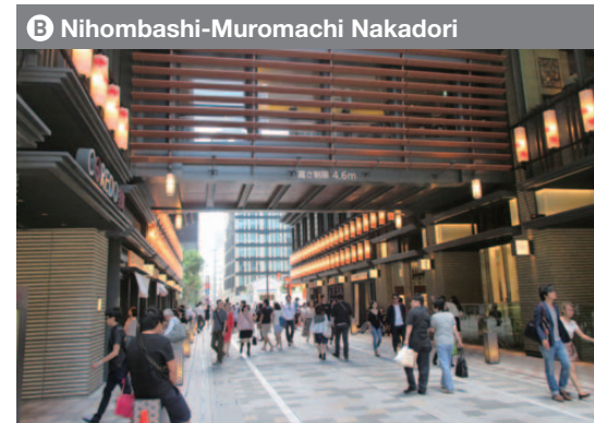
B Nihombashi-Muromachi Nakadori Pedestrian zone times: Weekdays, weekends and holidays: 11:00 a.m. to 8:00 p.m.