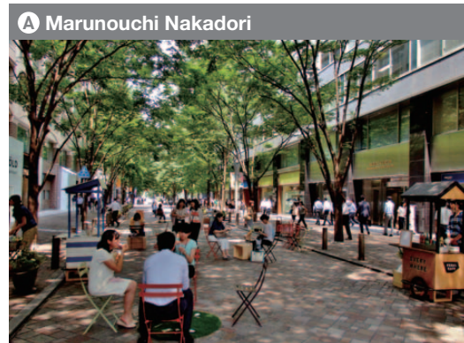
A Marunouchi Nakadori Pedestrian zone times: Weekdays: 11:00 a.m. to 3:00 p.m. Weekends and holidays: 11:00 a.m. to 5:00 p.m.